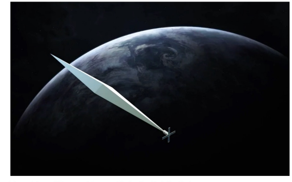
The sculpture will be seen at dawn and dusk as it reflects the Sun's rays

"Space is actually really big, and it's extremely unlikely that it will collide with anything else. The main thing to worry about is it deploying successfully around other satellites. We've been working with the launch provider to come up with a plan to mitigate against any accidents there."