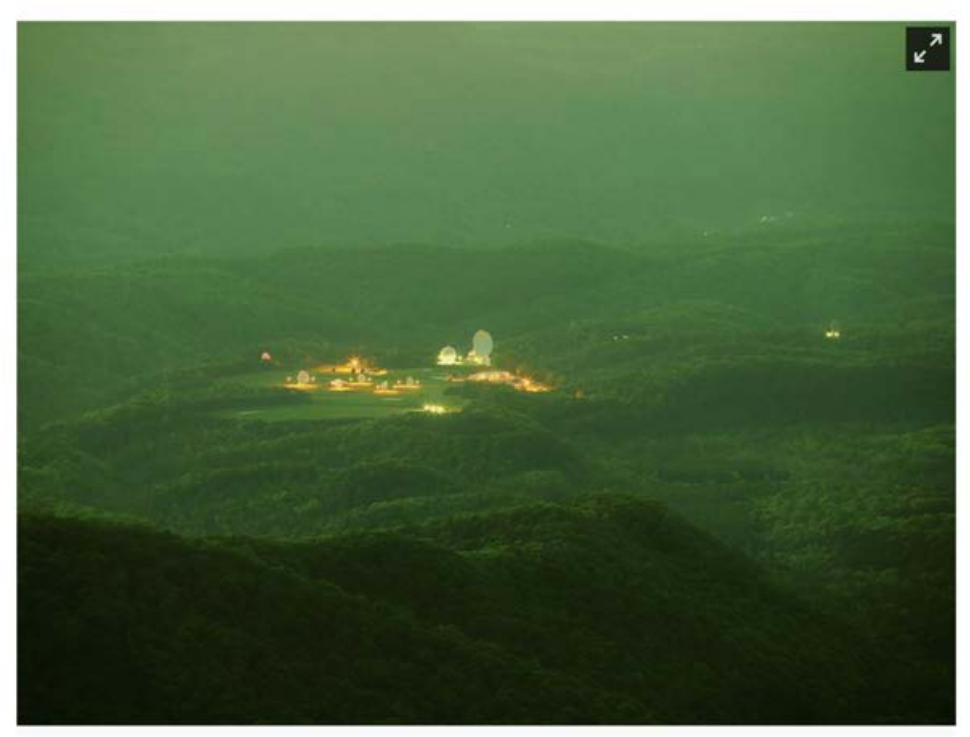
They Watch the Moon © Trevor Paglen

1150 25TH ST. SAN FRANCISCO, CA 94107 tel: 415.576.9300 / fax: 415.373.4471 www.altmansiegel.com