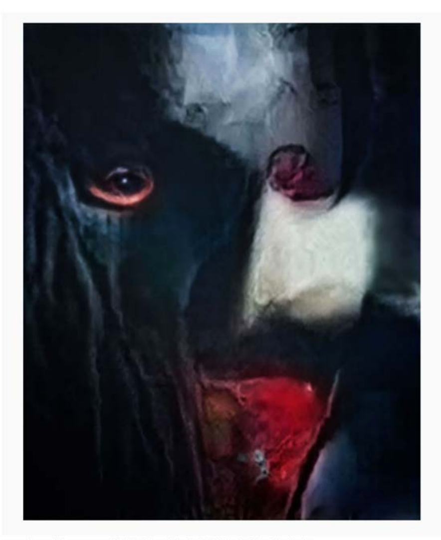
Trevor Paglen, Vampire (Corpus: Monsters of Capitalism) Adversarially Evolved Hallucination (2017), dye sublimation print 0 and photo: Trevor Paglen. Image courtesy of the artist; Metro Pictures, New York; Altman Siegel Gallery, San Francisco

You need tremendous amounts of data in order to really make AI sing and make it do useful stuff. And because you need that volume of data, you can really only do it if you have an infrastructure that is basically a planetary-scale surveillance infrastructure. And then you have to have the ability to consolidate that information in centralised places, ie corporations or states. And so, given those two facts, the politics of the infrastructure is one of extreme centralisation of power in either nation-states, which China would be a good example of, or in corporations, like the Facebooks and Amazons.