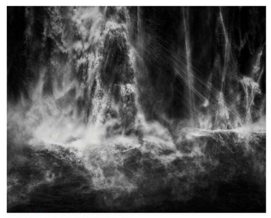
Trevor Paglen, Shoshone Falls, Hough Transform; Haar (2017), silver gelatin print 6 and

1150 25TH ST. SAN FRANCISCO, CA 94107 tel: 415.576.9300 / fax: 415.373.4471 www.altmansiegel.com