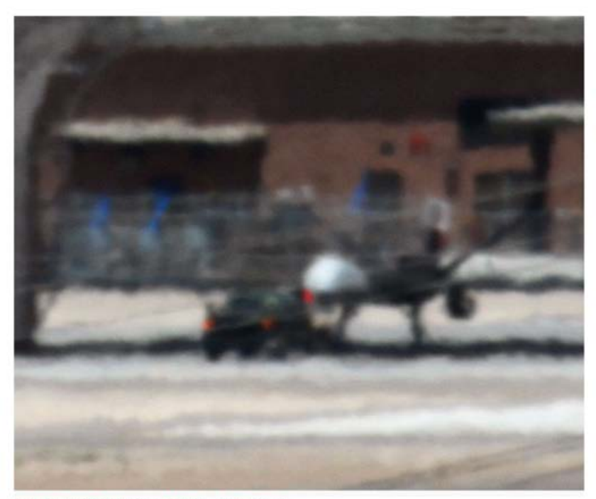
Trevor Paglen, Reaper Drone (Indian Springs, NV; Distance ~ 2 miles) (2010) C-print

1150 25TH ST. SAN FRANCISCO, CA 94107 tel: 415.576.9300 / fax: 415.373.4471 www.altmansiegel.com