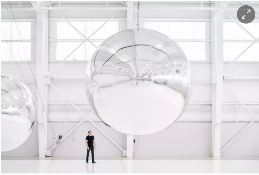
Prototype for a Nonfunctional Satellite, 2013. Part of a series exploring the idea of launching a decorative sculpture into the night sky. The object would remain in low orbit for several weeks before burning up on re-entry.

That set him thinking about the history of secret places. In 2003, he made the first of many camping trips to the blueprint of all these off-grid locations, Area 51, the highly classified air force base in Nevada, pitching up on snow-topped Tikaboo Peak to see what he could see. That started him on his artistic odyssey into the world of "rendition and drones and extra-judicial spaces".