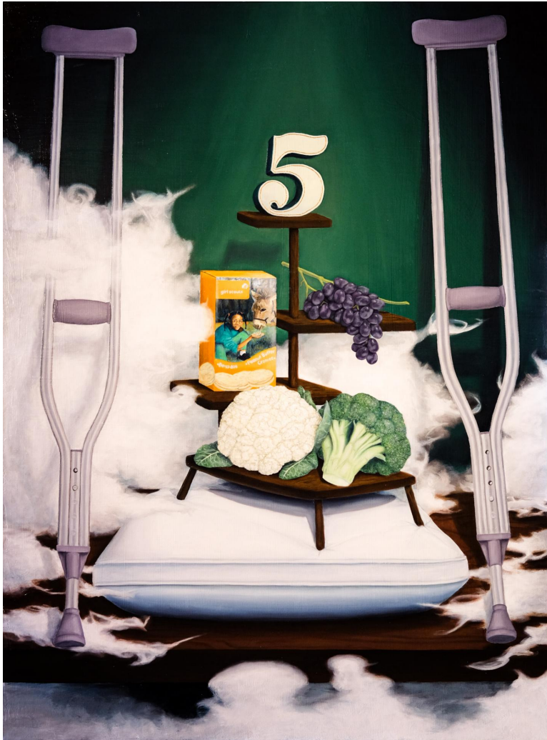
Troy Chew, Five on it , 2020, oil on canvas, 121.9 x 91.4 cm.