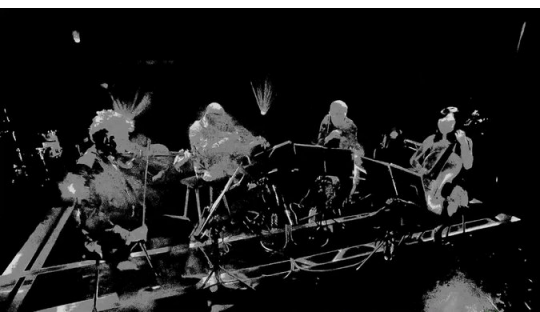
An alternative rendering of "Sight Machine."

The performance, titled "Sight Machine," combines image-making and artificial-intelligence technology: On Saturday, the avant-garde string quartet will play a concert while Paglen's own A.I. mapping system projects machine-generated images of the musicians behind them in real time. Paglen programmed code, akin to surveillance A.I. algorithms, which processes a live video feed of the performance to create "images of what a particular algorithm is 'seeing," he says, which in this case is the musicians' movements. "I wanted to make an artwork that really underlined the contradiction between how machines see and how humans see," Paglen explains. "Because music is so affective and is just as corporeal as it is cerebral, I thought coupling a music performance with machine vision adds up to something that work on an emotional, aesthetic and intellectual level."