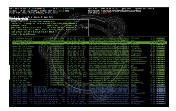
Screenshot of Tor relay connection listing.

TP The Internet is a predatory network that is, on one side, potentially a very coercive tool of totalitarian power and, on the other side, a tool that will increasingly be used to allocate rights and privileges through commercial means—credit scores or insurance rates and that sort of thing. Given that situation, can we imagine a different kind of network? Can we envision a network that is nonhostile? Our project Autonomy Cube is an attempt to imagine what this alternative network might be like.