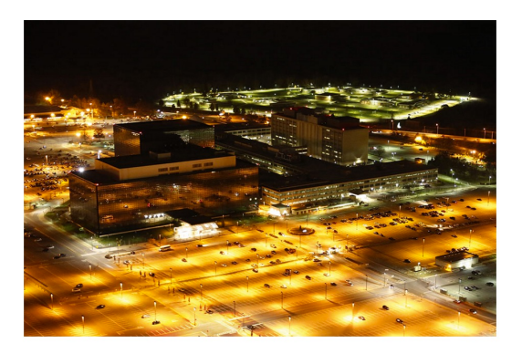
Trevor Paglen, National Security Agency, Ft. Meade, Maryland, 2013, C-print, 35.625 \times 53 inches.

Trevor Paglen We've come to learn that the network is hostile. The Internet was supposed to be the greatest tool of global communications and means of sharing knowledge in human history. And it is. But it has also become the most effective instrument of mass surveillance and potentially one of the greatest instruments of totalitarianism in the history of the world. Jacob Appelbaum You might think of the Internet as a series of servers or companies and think of how you personally connect to it. Instead, there are signals intelligence stations around the world, along with enormous fiber-optic cables used for interception. Many computers have been compromised to serve for signals intelligence collection. Berlin and Vienna, for example, are signals intelligence platforms, which are actually used as part of the special collections service. When German Chancellor Angela Merkel was collected on by the NSA, it happened from a US embassy. In fact, we know that it happened from the one in Berlin, on Pariser Platz. The way that computers are broken into is via passive tap, a fiber tap of the kind that Trevor is fond of scuba diving for and taking photographs of. The collection is possible because the NSA works to compromise standards: you think that something is secure—you do banking online or read online-and the NSA makes sure that you believe it is safe, but, actually, it isn't.