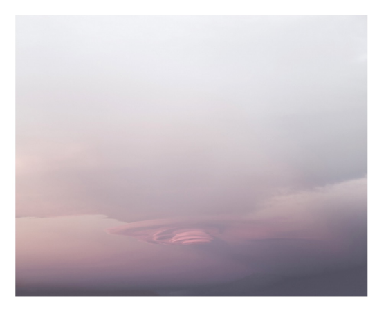
Trevor Paglen, Untitled (Reaper Drone), 2013, C-print, 49.125 x 61.125

Every time we talk about our work, people say, "But what about the Internet apocalypse? What if people use the Tor network to do bad stuff?" Jake, do you want to take that on?