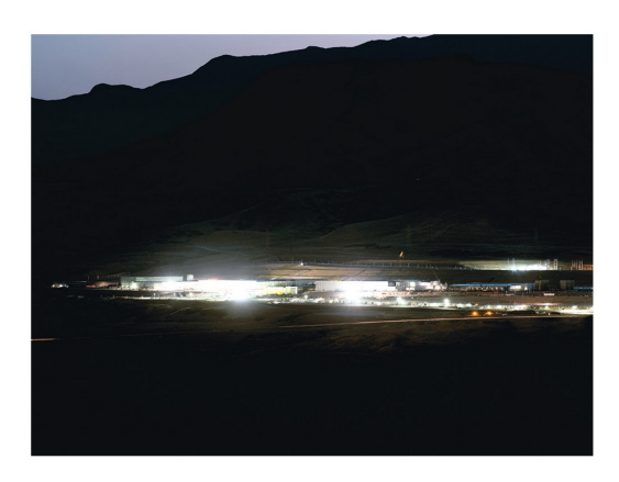
Trevor Paglen, National Security Agency Utah Data Center, Bluffdale, UT, 2012, C-print, 36.875 x 48.875 inches.

The program group that bothers me the most is called JTRIG [Joint Threat Research Intelligence Group] and they're a division of the British GCHQ [Government Communications Headquarters]. JTRIG is a mass propaganda operation; it's using data for disinformation and for changing political outcomes, harassing people, defaming and harming them—treating them as subhuman, effectively. And that's an entire division of the intelligence service; they have lots of people working on that. For example, they find someone who's a particularly religious Catholic or Muslim—I'm sure it doesn't happen to Catholics as much as it happens to Muslims-and then they use that information to blackmail them. These are the claims that they make themselves. They use the mass surveillance data sets-those fiber-optic cables-and there's a full life cycle between the cable tap and actually using that information to harm people in a material fashion. For me, that's the hallmark of a tyrannical operation. I don't want to see governments engaged in those kinds of secret and damaging activities.