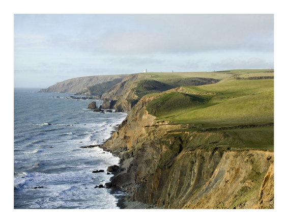
Trevor Paglen, National Security Agency Surveillance Base, Bude, Cornwall, UK, 2014, C-Print. 48 x 64 inches.