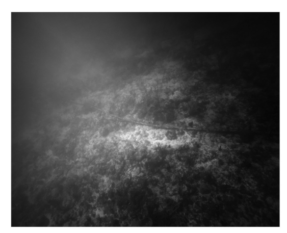
\label{eq:control_control_control} Trevor\ Paglen, Columbus\ III, NSA/GCHQ-Tapped \\ Undersea\ Cable, Atlantic\ Ocean, 2015.\ C-print.\ 48\times60\ in. \\ Courtesy the artist and Metro\ Pictures, New\ York.

Paglen: It's also terrifying. I always thought of the sublime as that which reminds you—that makes you confront—the limits of your own senses. There's an aspect of fear and beauty mixed together. The Alps were sublime because they would kill you, no problem.