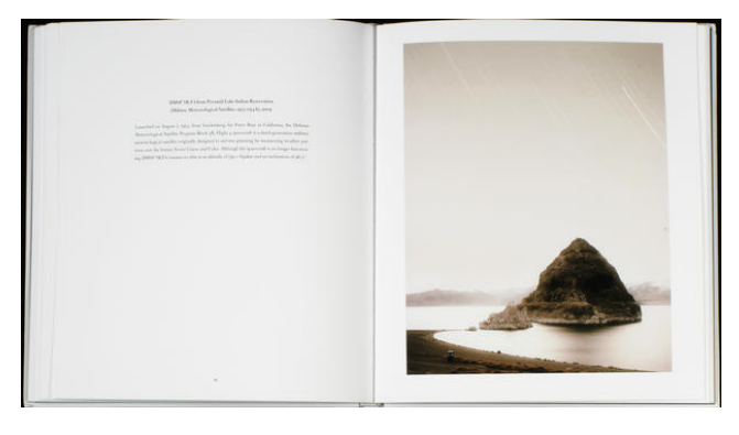
Invisible, by Trevor Paglen. Published by Aperture, 2010.

innards of off-limits military bases and unofficial black sites buried in the deserts of the American West. He hikes up onto mountain peaks, often at night, to capture the light emanating from miles and miles away, like some photo-geek superhero, all in the name of showing what we're not meant to see. Despite his own admission that his aesthetic choices are limited, the photographs are lovely and haunting. They of course need accompanying text to illuminate their meaning, but text and books do well together.