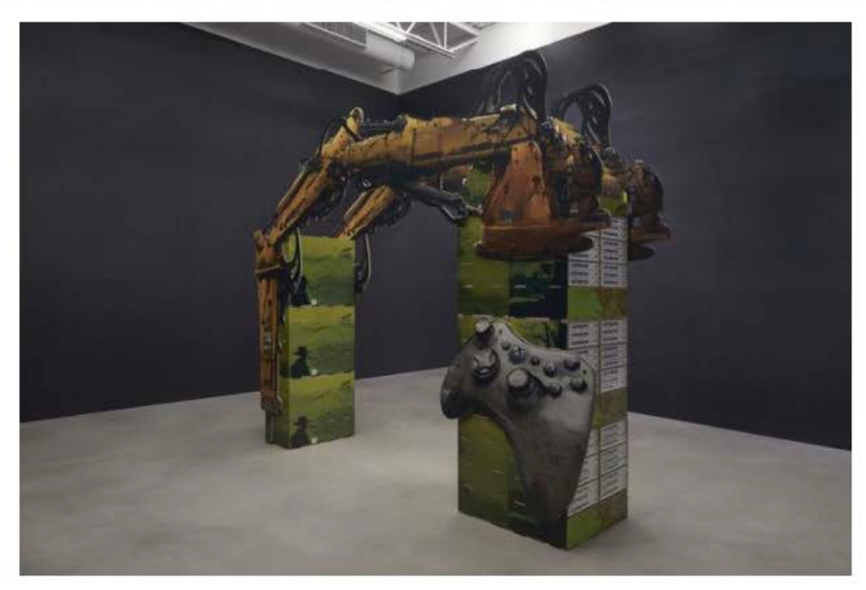
Exhibition view: Simon Denny, Mine, Petzel Gallery, New York (18 March-15 May 2021).

Many of the works in the Petzel show originate from an exhibition of the same