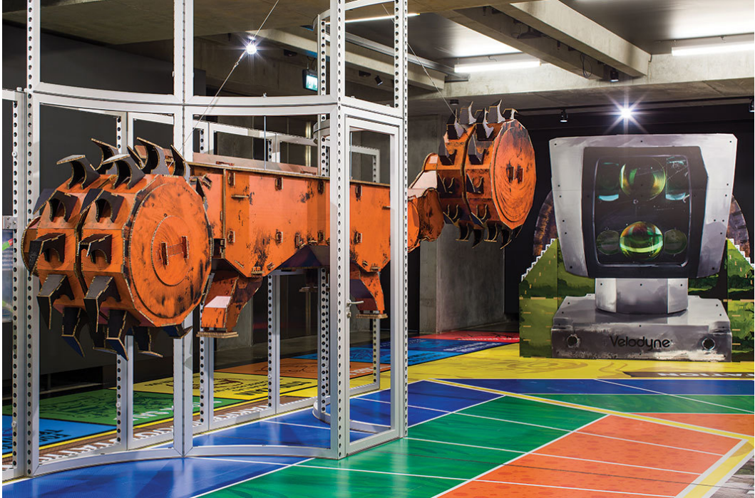
View of "Simon Denny: Mine," 2019–20 , Museum of Old and New Art, Hobart, Australia. From left: Joy Global semi-autonomous longwall coal mining 7LS8 shearer cardboard display, 2019; Caterpillar Inc. Autonomous haul 793F Mining Truck Extractor pop display, 2019.