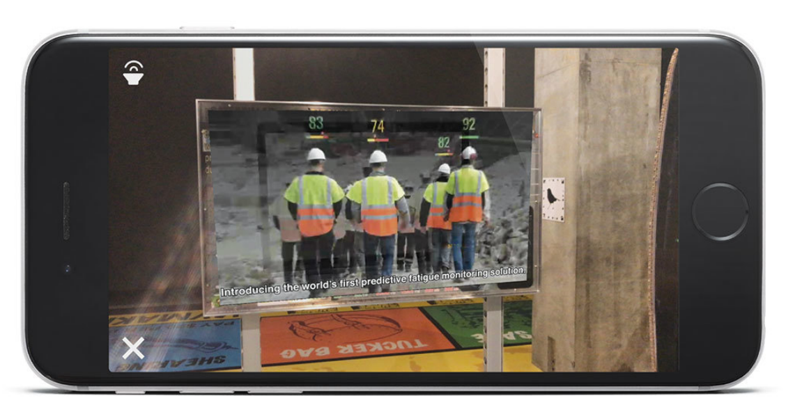
Smartphone showing screen capture from augmented-reality component of Simon Denny's Caterpillar Inc. Biometric worker fatigue monitoring smartband promotion screen video token, 2019.

If the first room is stark, the second is Candy Crush chromatic—dominated by large cardboard cutouts of automated machines manufactured by the corporate giants of the global mining industry, including Rio Tinto, Komatsu, and CAT. On the gallery floor is a blown-up image of the 1960s Australian board game Squatter , a kind of outback version of Monopoly in which the main assets are sheep stations. The obstacles for the players, or aspiring farmers, of the original version—flood damage, droughts—have become, in the past ten years, the devastating new normal for Australian agriculture. The nation has long been nicknamed (after the title of Donald Horne's 1964 novel) "the Lucky Country," thanks to its imperviousness to recession, largely a consequence of the global economy's ongoing thirst for its mined raw materials. Yet this strength is what is eroding it into a climate-change-fueled hellscape, its barren, red center operating like a microwave in the summer, radiating heat out toward the farmland, towns, and cities that huddle along the coasts and bringing punishing dust storms, wildfires, and temperature spikes that melt tarmac—along with premonitions that Mad Max might not be mere dystopian fiction.