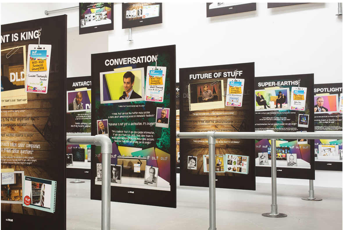
View of "Simon Denny: All you need is data: the DLD 2012 Conference REDUX rerun," 2013, Petzel Gallery, New York.

canvases for every session at the titular tech conference, then mounted them on steel barriers that unceremoniously corralled viewers into something like a security line. In 2015, he colonized Venice's Marco Polo Airport as part of "Secret Power," New Zealand's official contribution to that year's Biennale, by printing, at a one-to-one scale, an image of the enormous painted ceiling of the city's Biblioteca Nazionale Marciana and sticking it to the airport's floor. The amount of time a viewer spent with this piece was determined by the wait at passport control, the whims of Italian border officers, and how long it took for luggage to drop onto carousels. (Marco Polo was Italy's first post-9/11 airport, fully equipped with the surveillance technologies that the United States insisted the world adopt in the wake of the terrorist attacks.) At MONA, "Mine" also subtly but firmly activates and prompts audience choreography: If visitors wish to see the show's AR elements more than once, they must reset their O devices; the worker's cage, though static, refers to the astounding notion that Amazon actually considered these small prisons to be valuable innovations.