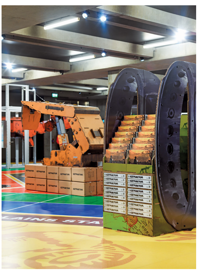
View of "Simon Denny: Mine," 2019–20 , Museum of Old and New Art, Hobart, Australia. From left: Caterpillar Inc. semi-autonomous longwall coal mining roof support system cardboard display, 2019; Caterpillar Biometric worker fatigue monitoring smartband Extractor pop display, 2019.

When audiences scan the trigger in Denny's cage, a tiny bird is brought to "life," appearing, when the cage is viewed through the O device's screen, to chirp and flutter around inside it—the first ecological warning in the exhibition. The canary in the coal mine is the classic metaphor for exploited labor, and the artist doubles down on its presence with a suite of collages overlaying printouts of the Amazon patent with 3-D renderings of the bird—a King Island brown thornbill, native to Tasmania, whose human-caused extinction is imminent. Sightings of these thornbills are a rarity, and a team of AR designers created his version based in part on photographs and audio recordings taken of the birds on a recent expedition by a group of researchers from the Australian National University. The O devices thereby also become a means of digital repopulation: As more viewers gather around the cage, each summons her very own thornbill, filling the gallery with the growing sound of birdsong.