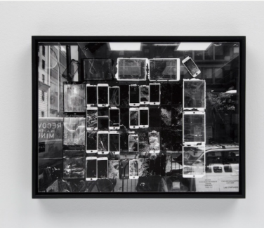
Shannon Ebner, COMMERCIAL STREET, 2022, archival pigment print mounted on aluminum, 11 ^{1} 4 by 14 ^{1} 2 by 1 ^{1} 2 inches.

For her 2019 exhibition at Altman Siegel in San Francisco, "Wet Words in a Hot Field," Ebner constructed individual letters of the alphabet out of paper and pasted them onto a wall with water to photograph each separately; she then selfreflexively composed the prints of the letters into phrases borrowed from the instruction manuals of 35mm DSLR cameras. The same alphabet appeared in this exhibition in her visual-text poem FRET (2022), which occupied a gigantic wall in the gallery with a meditation on loss and anxiety: HOW THE SOCIAL GOT / REASSEMBLED & / HUNG OUT TO DRY / ON / AN / IMPALPABLE HORIZON / OF STORM DRAINS, / BULKHEADS / AND PUMP STATIONS. Her methodology remained promising, but the form (which carried traces of that mutable category of "concrete poetry") was affected by a