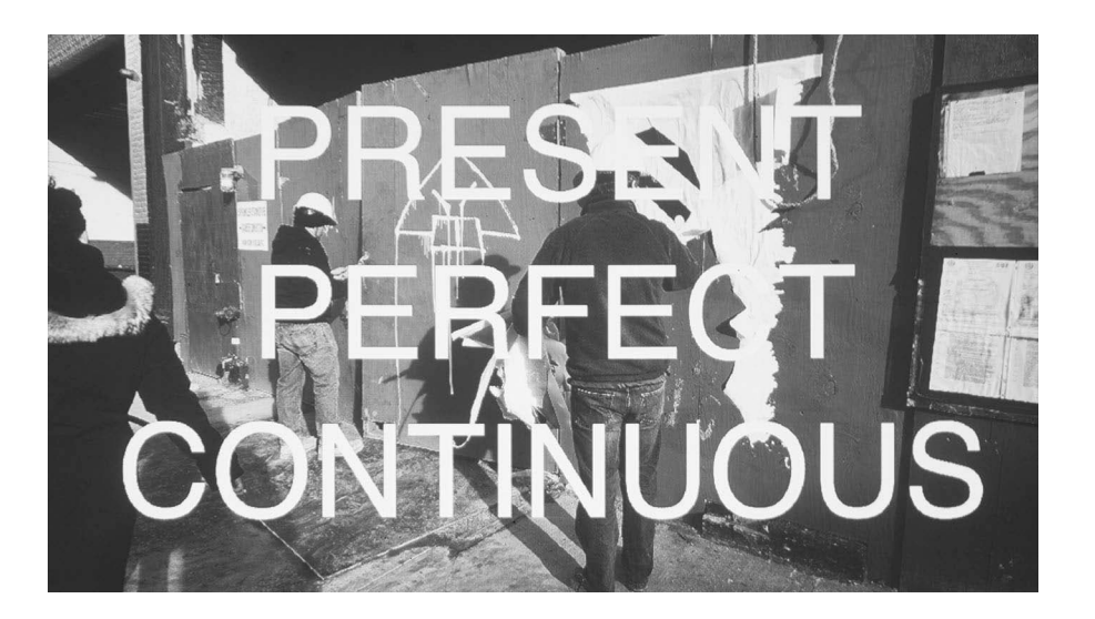
Figure 10. Shannon Ebner, A PUBLIC CHARACTER, 2015, Digital color video with sound, 13 minutes. Edited by Erika Vogt. Score by Alex Waterman. Photographs by Timothy Schenck. Courtesy of the artist and Sadie Coles HQ, London.

Ebner's text at this point ruminates on language, history and the possibilities for change, and given her novel expansion of photomontage, bears implications for what the medium might be capable of doing now. For the words overlaid onto the images in this segment of the video are a series of verb tenses, and they foreground the inseparability of construction and destruction that underpins both the means by which photomontage is produced and the process, on a monumental scale, of the redevelopment of public space: 'A SIMPLE PRESENT' (the action is happening now), 'PRESENT CONTINUOUS' (to emphasise that it is still happening, that we are in the present indefinite), 'SIMPLE PAST' (the destruction is complete), 'PAST CONTINUOUS' (but it is ongoing), 'PRESENT PERFECT' (the present is inseparable from the past), 'PRESENT PERFECT CONTINUOUS'