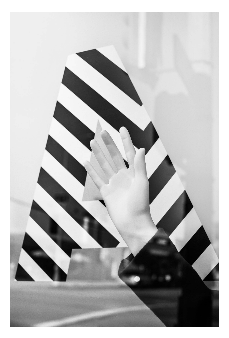
Figure 11. Shannon Ebner, BLACK BOX COLLISION A, No. 19, 2013, Epson Inkjet, 64.03 x 42.95 inches.

(what started in the past continues in the present), 'FUTURE CONTINUOUS' (expect more to come) and 'FUTURE PERFECT CONTINUOUS' (but at some point it must end). Whether this end will be the outcome of productive activism or global self-annihilation through the mindless pursuit of capital is left unresolved.