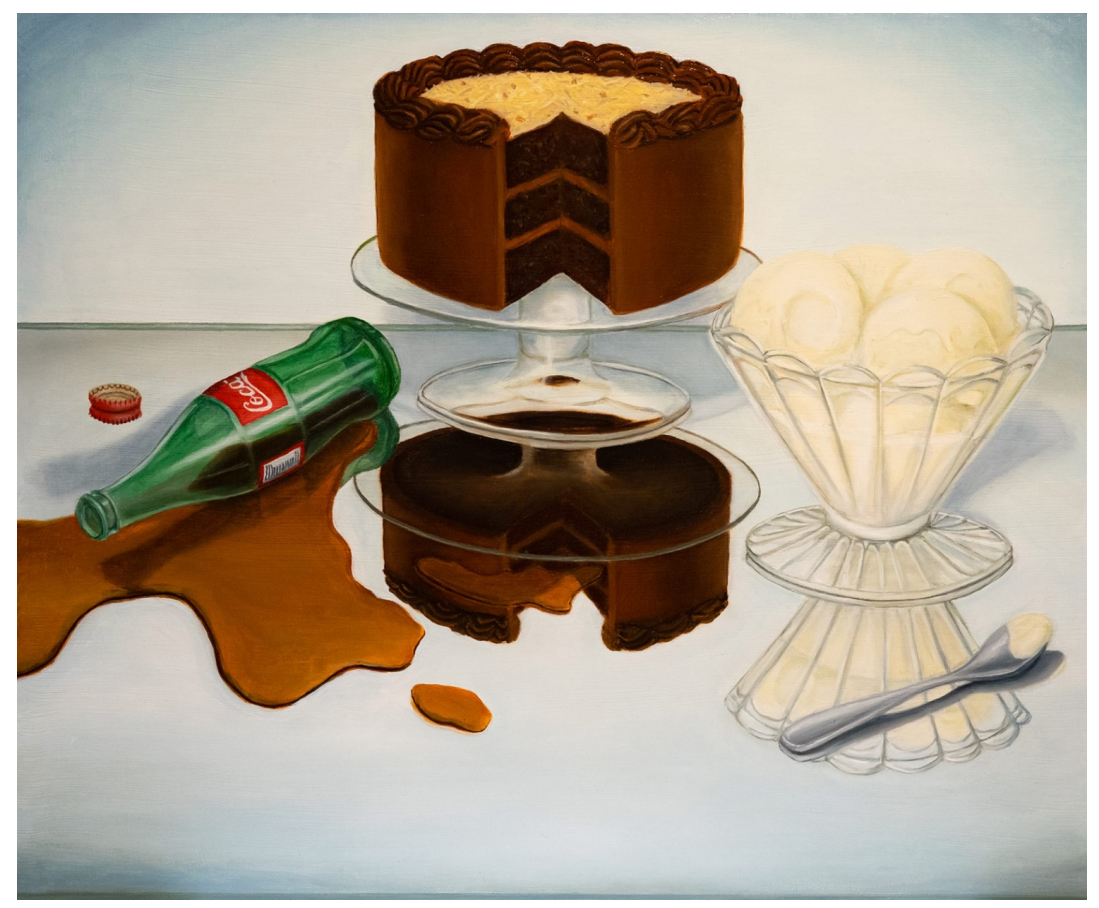
Above Yay Area

1150 25TH ST. SAN FRANCISCO, CA 94107 tel: 415.576.9300 / fax: 415.373.4471 www.altmansiegel.com