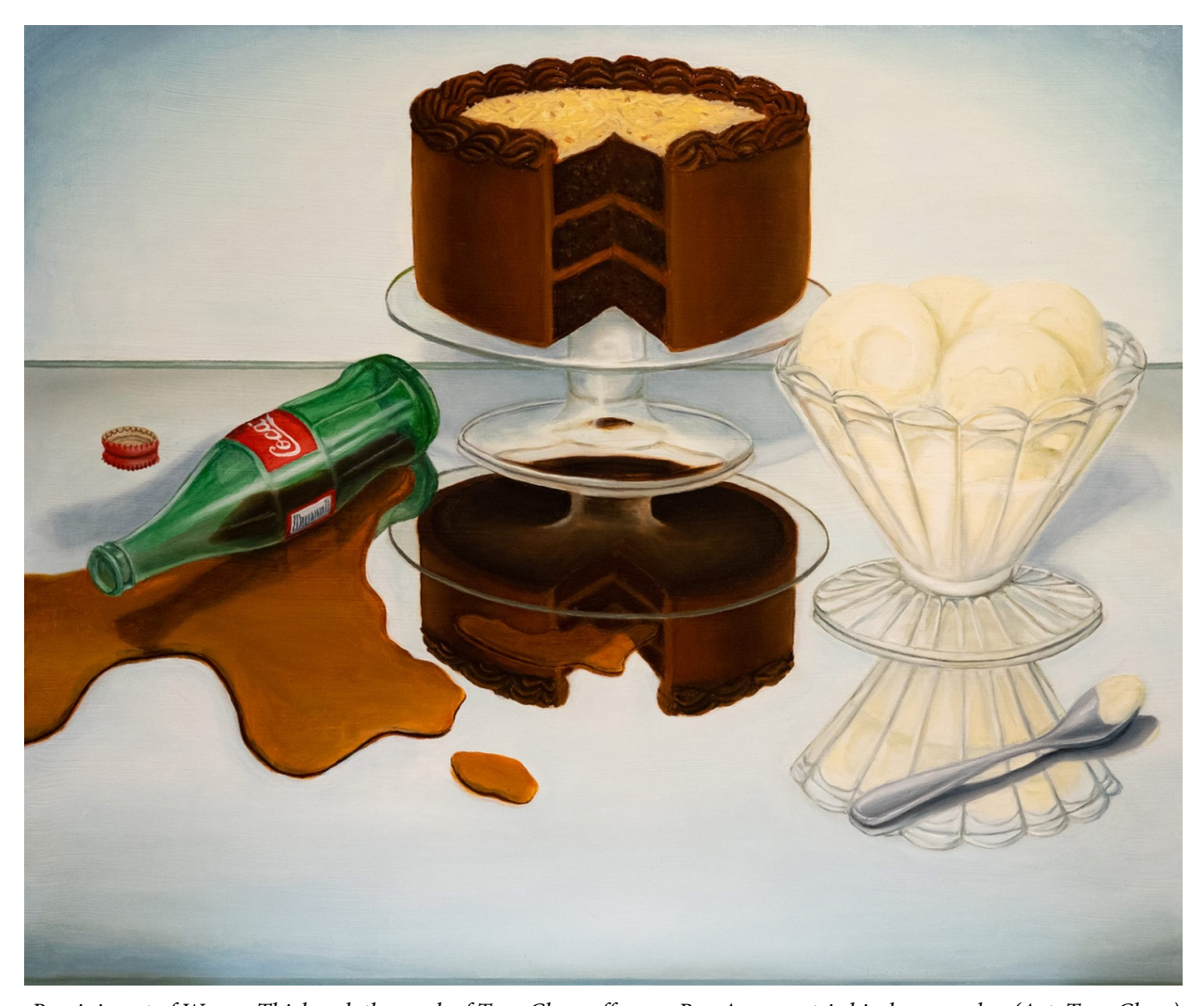
Reminiscent of Wayne Thiebaud, the work of Troy Chew offers up Bay Area-centric hip-hop puzzles. (Art: Troy Chew)

Berggruen Gallery, CULT, and Glass Rice showcase local artists.