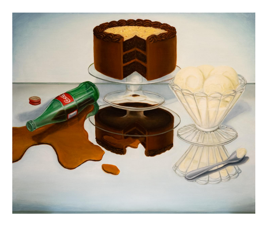
Troy Chew, Yay Area , 2020, oil on canvas, 50.8 × 61 cm. Courtesy: the artist and CULT Aimee Friberg Exhibitions, San Francisco

1150 25TH ST. SAN FRANCISCO, CA 94107 tel: 415.576.9300 / fax: 415.373.4471 www.altmansiegel.com