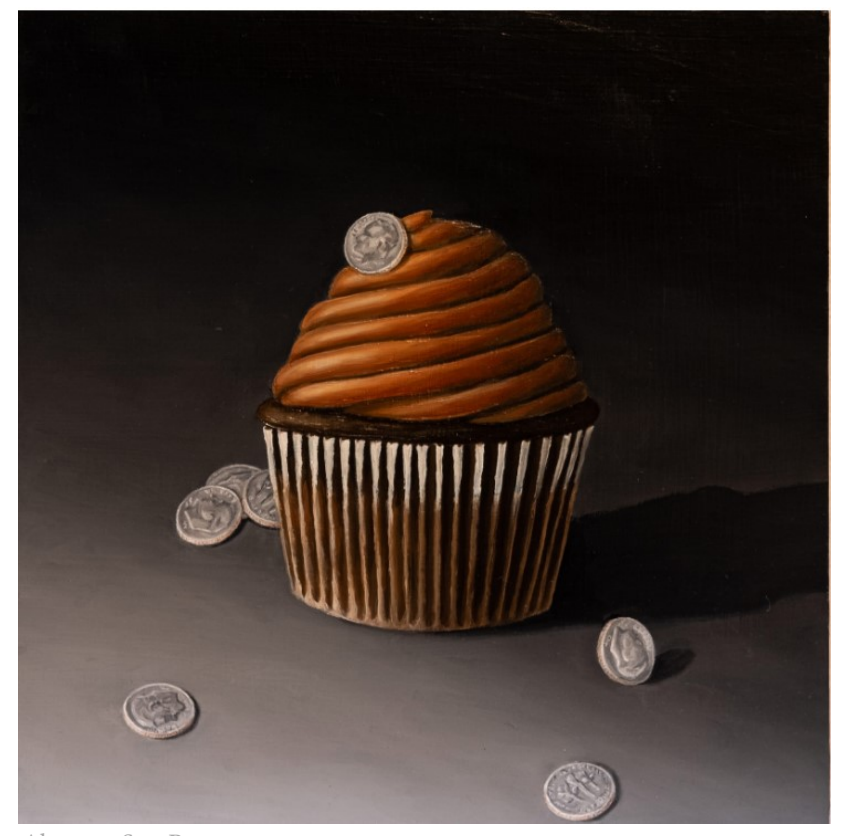
Above Sup Bay