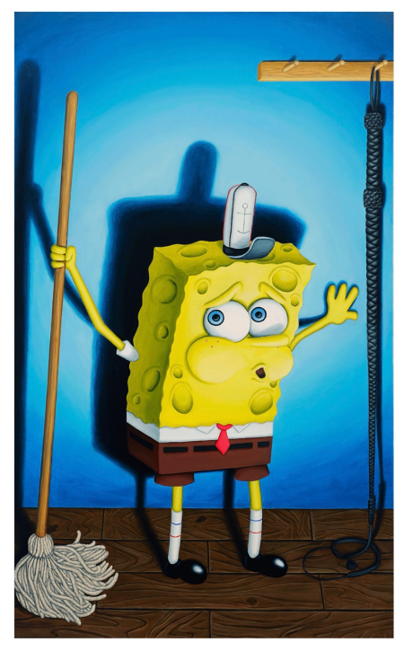
Troy Lamarr Chew II, As seen on TikTok, 2021, oil on canvas 152 × 91 cm.

Boas, Natasha, "What to See During San Francisco Art Week," Frieze, January 19, 2022