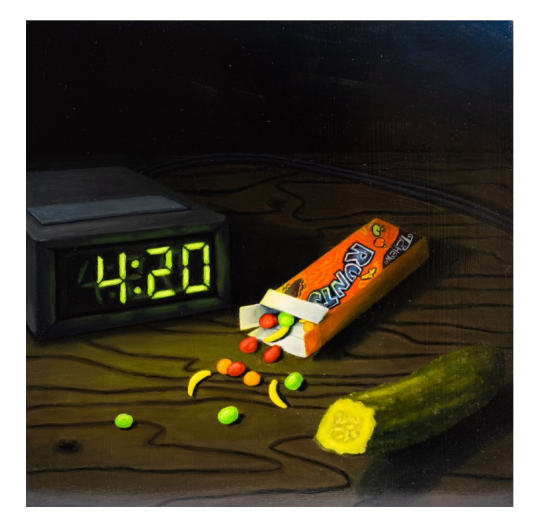
Ask Berner (2020).

I want people to listen to the music they are listening to a little deeper. These words are context clues and can help be identifiers to understanding the music and maybe even understanding Black culture.