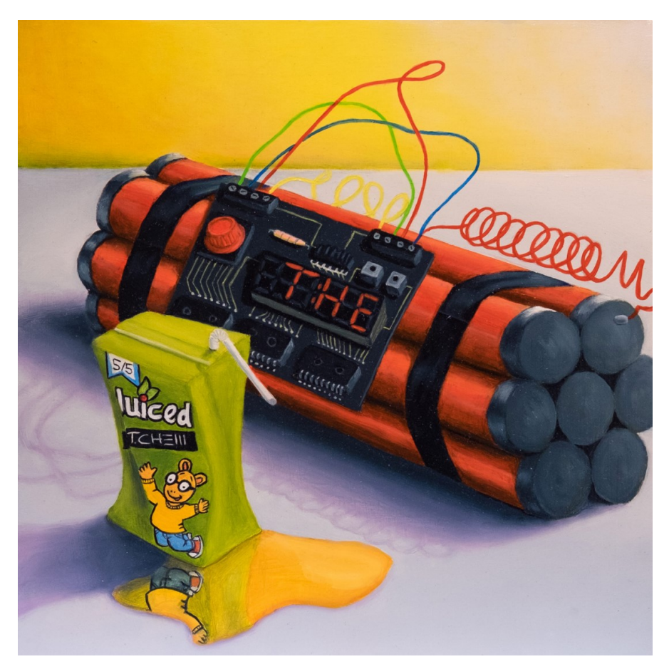
Like tic, tic (2020).

1150 25TH ST. SAN FRANCISCO, CA 94107 tel: 415.576.9300 / fax: 415.373.4471 www.altmansiegel.com