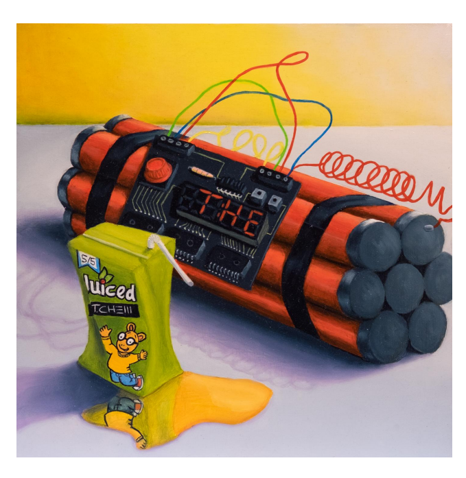
Troy Chew, Like tic , tic , 2020, oil on canvas, 30.5 \times 30.5 cm.

Investigating the 'slanguage' – as the artist calls it – used to speak about money, women and drugs, and re-contextualizing it within vanitas still lifes, Chew plays on notions of appropriation – not only in terms of his use of European painting traditions, but also in relation to how slang and hip-hop culture have been co-opted and even effectively killed off through capitalist exploitation. Chew is sensitive to the debates around what is contestably referred to as African American Vernacular English (AAVE) – or, even more problematically, Ebonics – and understands that communities of colour create their own forms of communication as a reaction to systems of social and economic inequity and erasure, and that 'slanguage' is as viable as any other language. The artist expands on the unfortunate irony that sees the culture of marginalized groups being monetized for profit. For example, in Ball Street Journal - named after the eponymous E-40 album - loaves of bread lie next to cabbage, basketballs and paper: all symbols for money. Yet, the painting's imagery equally points to the poverty and food insecurity in the same communities where these vernaculars are born.