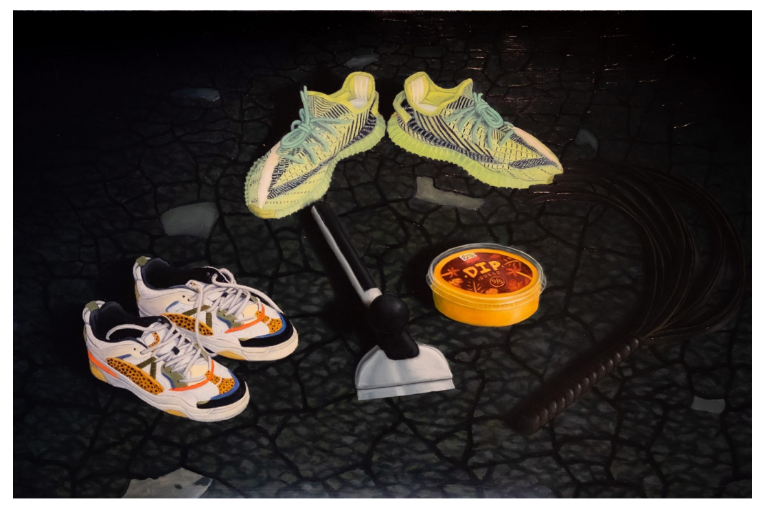
Above Ghost Rider

1150 25TH ST. SAN FRANCISCO, CA 94107 tel: 415.576.9300 / fax: 415.373.4471 www.altmansiegel.com