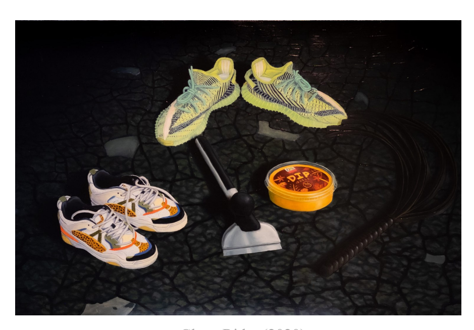
Ghost Rider (2020).