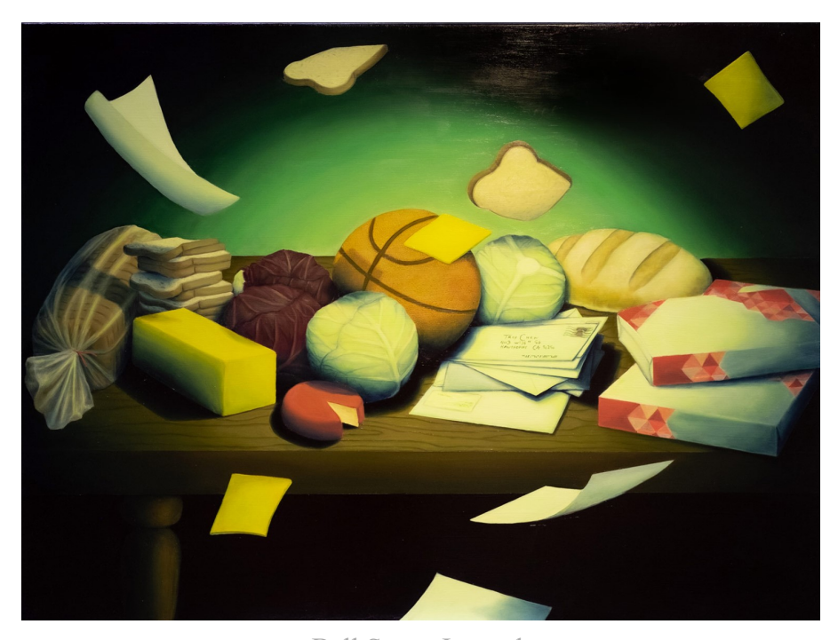
Ball Street Journal