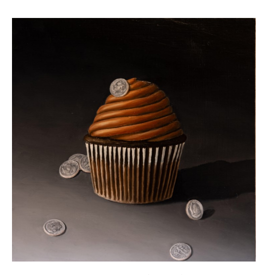
Sup Bay (2020).