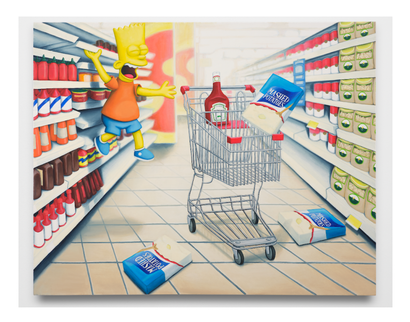
What I like, though, is that you still, at times, work with still-lifes, so you're working within art history...

1150 25TH ST. SAN FRANCISCO, CA 94107 tel: 415.576.9300 / fax: 415.373.4471 www.altmansiegel.com