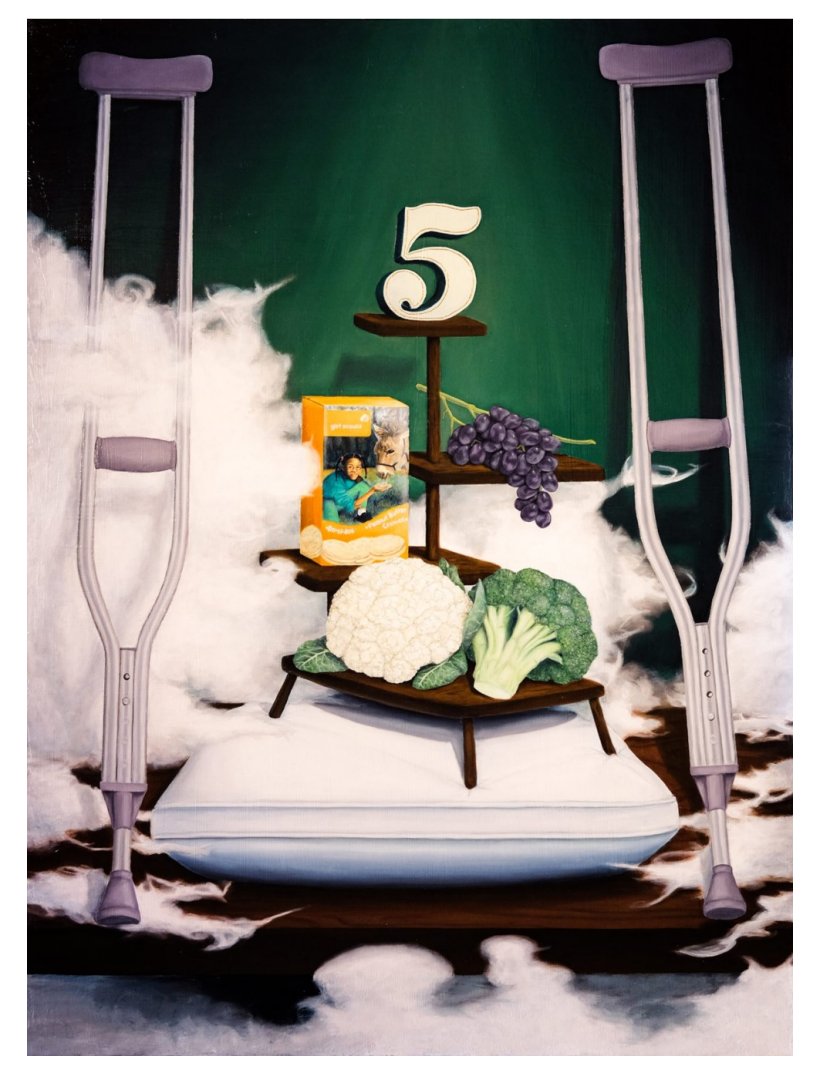
Five on it (2020).

1150 25TH ST. SAN FRANCISCO, CA 94107 tel: 415.576.9300 / fax: 415.373.4471 www.altmansiegel.com