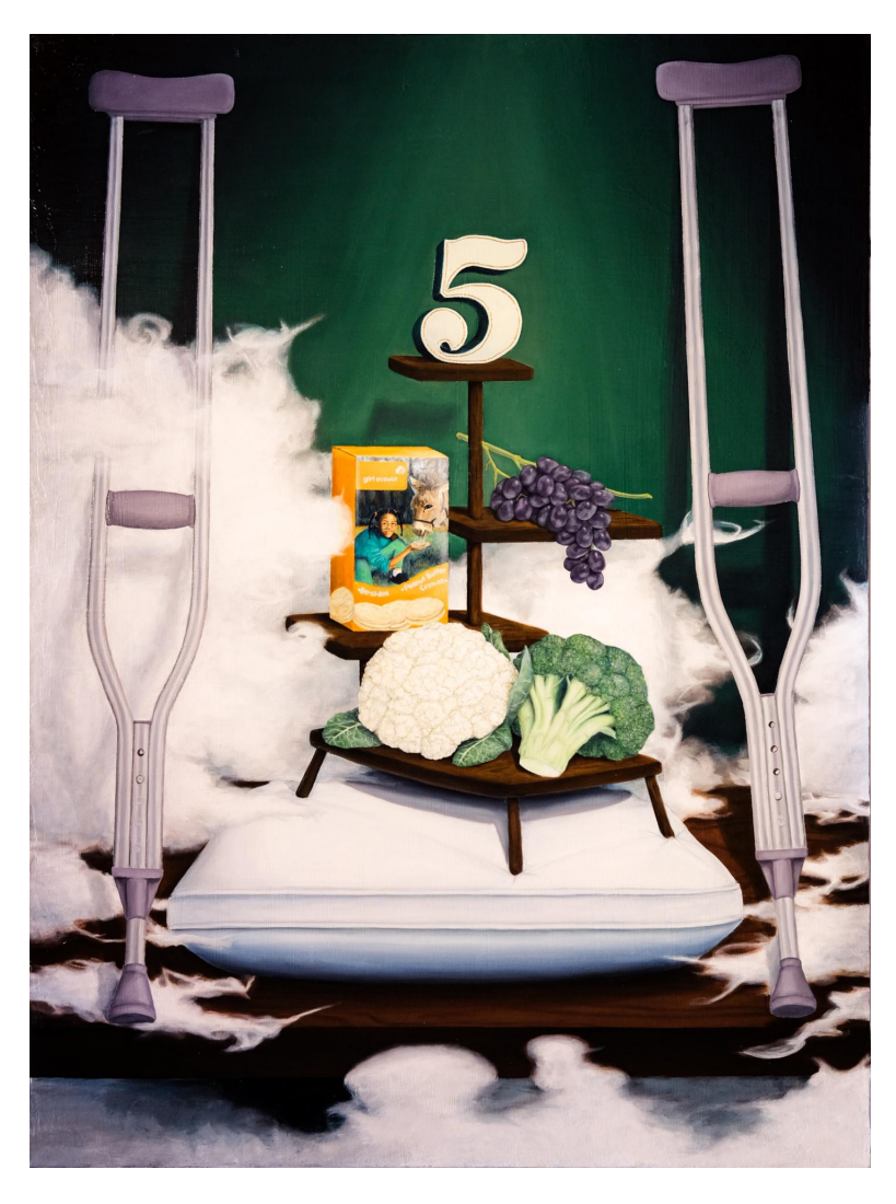
Troy Chew, Five on it, 2020, oil on canvas, 121.9 \times 91.4 cm. Courtesy: the artist and CULT Aimee Friberg Exhibitions, San Francisco

1150 25TH ST. SAN FRANCISCO, CA 94107 tel: 415.576.9300 / fax: 415.373.4471 www.altmansiegel.com