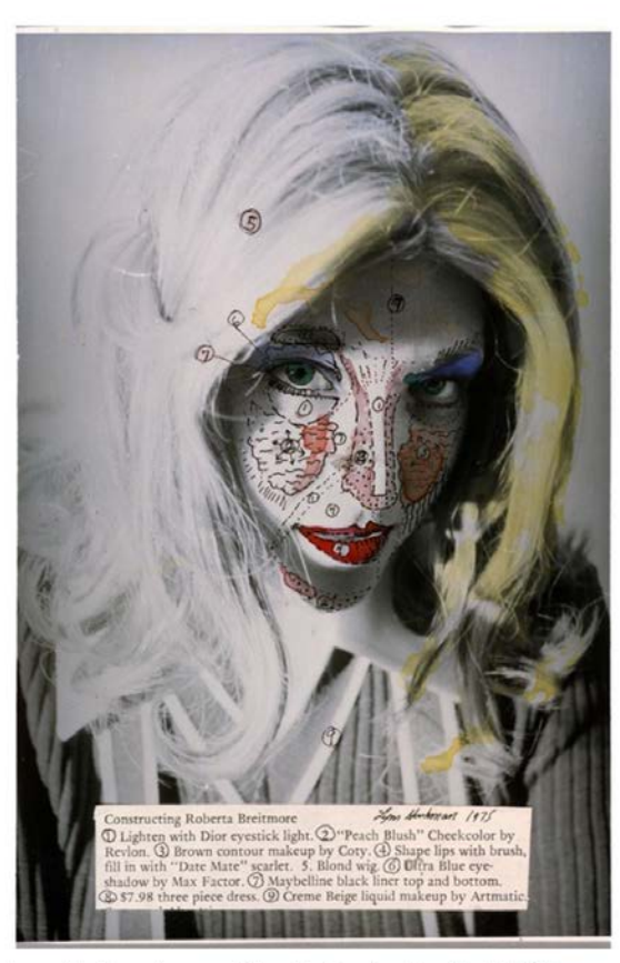
Lynn Hershman Leeson, Roberta's Construction Chart 1 , 1975. Archival digital print and dye transfer, 35 5/8 x 23 5/8 in (90.5 x 60 cm).

Leeson: So that's when ... I was only there once.