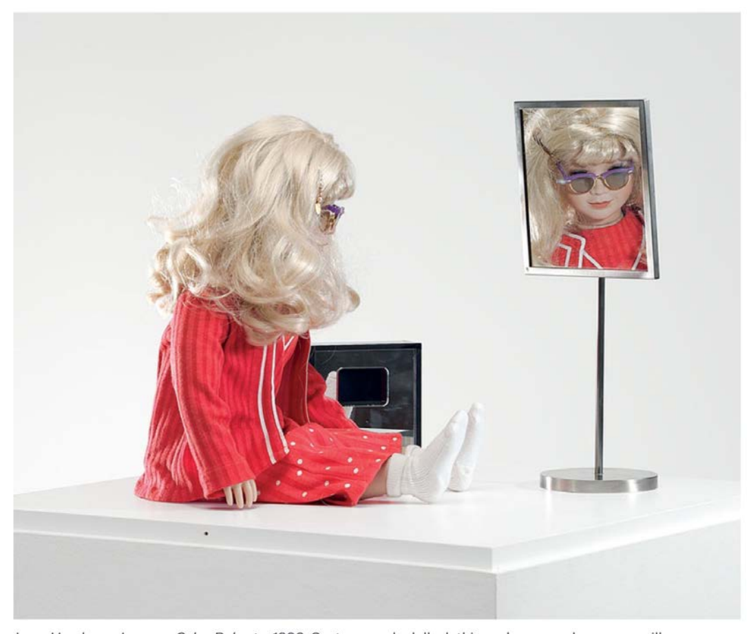
Lynn Hershman Leeson, CyberRoberta , 1996. Custom-made doll, clothing, glasses, webcam, surveillance camera, mirror, original programming, and telerobotic head-rotating system, Aprox. 17 % x 17 % x 7 % in (45 x 45 x 20 cm). Courtesy the artist; Bridget Donahue Gallery, New York; and Altman Siegel, San Francisco

Rail: Identity is one of the main themes in your art. One of key projects of feminist art is your exploration of socially constructed identity in Roberta Breitmore . Masks are used in art as a way to hide one's identity, shield secrets, or distance oneself or one's characters. Masquerade is also a tool to access another persona, often used at the turn of the 1960s and 1970s to cross gender binaries—by California feminist performance artists, Eleanor Antin and Linda Montano, or, for example, British musicians such as David Bowie and Peter Gabriel. With all your transcending boundaries between human and the machine and your interest in genetic cross, in your masquerades you have never crossed gender boundaries. Why?