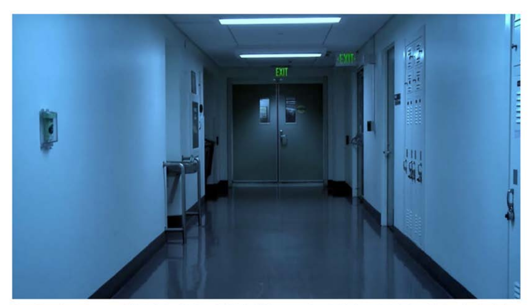
Lynn Hershman Leeson, The Infinity Engine , 2014- (still from a projection). Genetic Lab installation that includes genetically modified fish, CRISPR derived wallpaper, Bio-printed Ear, videotapes, etc. Dimensions variable.

1150 25TH ST. SAN FRANCISCO, CA 94107 tel: 415.576.9300 / fax: 415.373.4471 www.altmansiegel.com