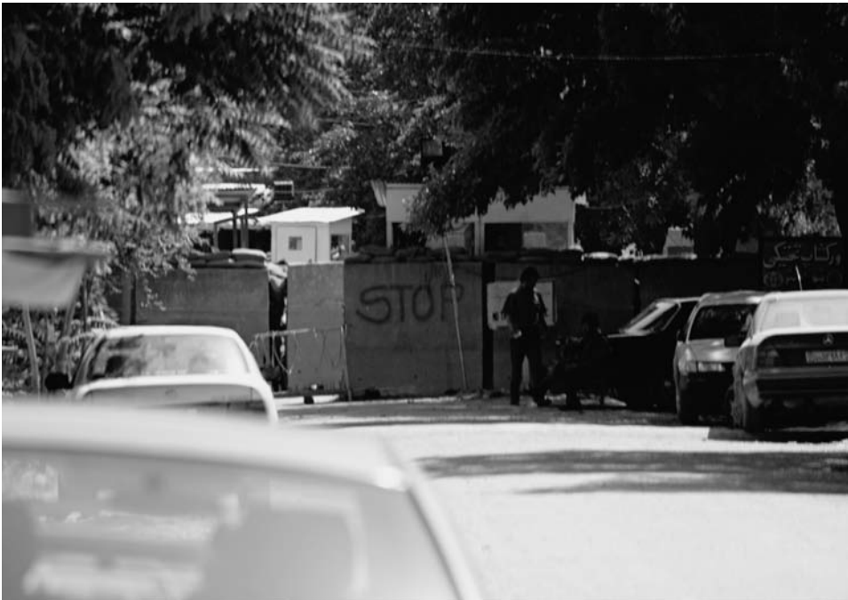
Paglen. Black Site: Kabul, Afghanistan. 2006.

But the overall question of the cultural politics of "viewing" art is something I just haven't spent that much time working out. I have a sense of what works for my own art, but don't really have a meta-theory of it. I'm much more interested in the cultural politics of producing art than the conditions of "consuming" it. I have long understood artworks as congealed social, political, and cultural relations, and that is what I'm interested in exploring. If I have anything to contribute to how we understand cultural production, it probably comes more from a "geographic" perspective than a traditional cultural-studies perspective. In a lot of my works, I try to set up various relations of seeing from which the artwork emerges. If I go out in the desert and spend a week photographing covert military operations, for example, it's quite likely that I'll ultimately end up with something quite formal or