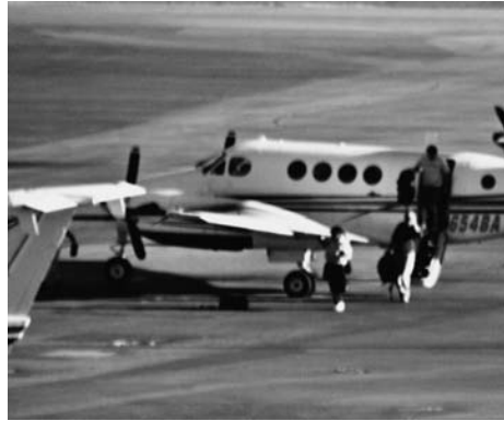
Paglen. Workers Gold Coast Terminal Las Vegas, NV Distance ~ 1 mile. 2007.

I take all of this as a starting point. In terms of my own aesthetic vocabulary, I tend towards images that manifest this dialectic. Images that 1) make a truth claim ("here's X secret satellite moving through X constellation," for example); 2) immediately and obviously contradict that truth claim ("your believing that this white streak against a starry backdrop is actually a secret satellite instead of a scratch on the film negative is a matter of belief"); 3) suggest a form of practice that could give rise to such an image ("if it's true that this is a secret satellite, then there's a whole lot more going on behind this image"); 4) suggest all of the above as an allegory for something about twenty-first-century images, knowledge, practice, aesthetics, and politics. Not all of the work I produce fits all of this—it's just a loose way I use to think about what it is I'm doing.