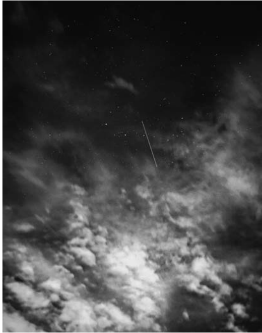
Paglen. Keyhole 12-3/Improved Crystal Optical Reconnaissance Satellite Near Scorpio (USA-129). 2007.