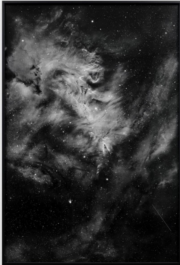
Installation view, Trevor Paglen, Unids , 2023, Altman Siegel, San Francisco.

The subjects of Paglen's photography, the Unids themselves, are all U.S. government-monitored objects that orbit the Earth, though, according to Altman Siegel, their "purpose and origin are officially unknown." This adds a tremendous amount to the speculation, and lord knows the average American will have their theories. "It's an alien!" "It's a weather balloon, just like in Roswell!" Rabbit holes of disbelief will suck what feels like days out of your life, and no matter where you look, you will never feel satisfied with the answers.