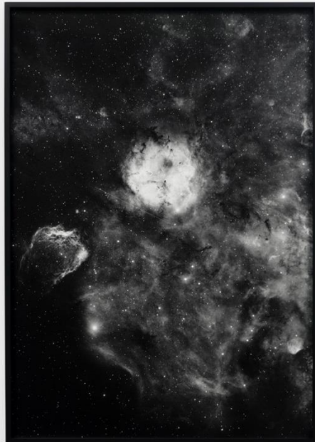
Installation view, Trevor Paglen, Unids , 2023, Altman Siegel, San Francisco.