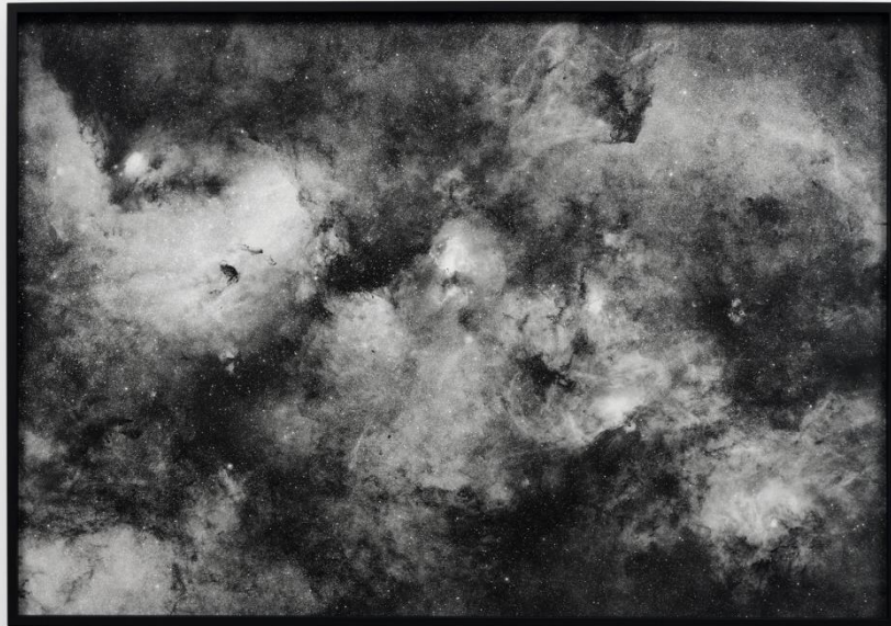
Installation view, Trevor Paglen, Unids , 2023, Altman Siegel, San Francisco. Courtesy of the artist and Altman Siegel, San Francisco

It's hard to believe, but there are times when the Earth - the planet and our surroundings - makes us feel humble. It's a common colloquialism in science and culture that we're just living on a small rock in space, and artists like Trevor Paglen truly manifest this sentiment with their groundbreaking work. At the Altman Siegel gallery, Paglen's series Unids - a slang term for UFOs used by amateur astronomers - depicts the vastness of space in one of the grandest displays of artistry you will ever see. Paglen's unmatched artistry takes the infinite frontier of our solar system and places it in our hands, giving us access to worlds far beyond our reach. In his world - Paglen's - we're all explorers; he is just giving us the field map. This stunning exhibition opened on November 2nd and has a scheduled closing date of December 22nd, giving viewers ample time to experience this breathtaking display of mastery.