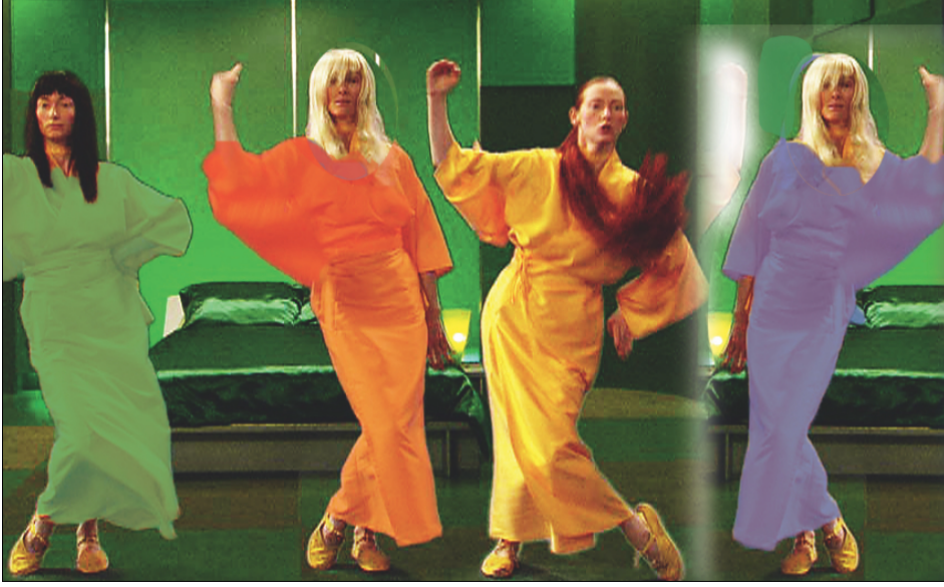
Stills from Teknolust (2002).