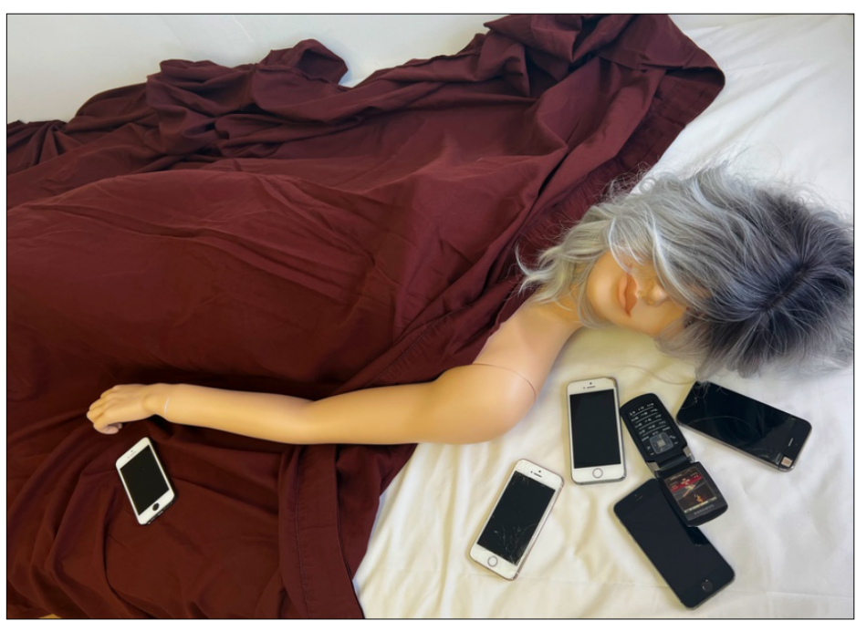
Phone \ Sleeper, 2023. \ Twin \ size \ bed, mannequin, bed \ sheets, 7 \ cell \ phones, 1 \ ipod \ touch. \ Courtesy \ of \ the \ artist.

HERSHMAN LEESON: Yeah. It's a portrait of that generation.