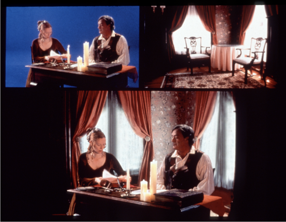
Stills from {\it Conceiving Ada} (1997). Courtesy of the artist.