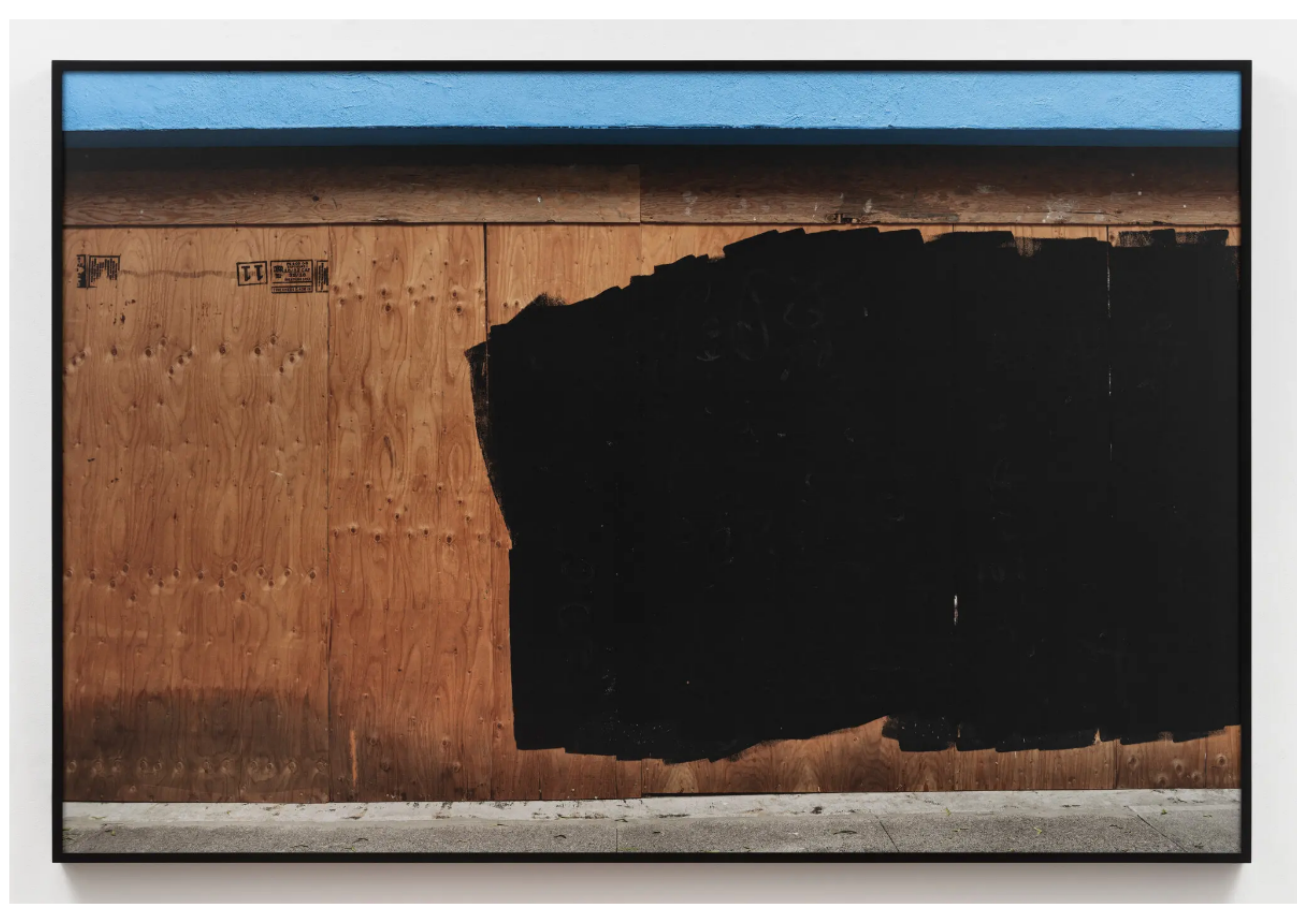
"Painting the Town #17" (2021) by Carrie Mae Weems, one of several images that look like abstract black paintings on plywood, but are instead photographs of boarded-up, painted-over windows. The artist and Gladstone Gallery, Fraenkel Gallery and Galerie Barbara Thumm. Photo by David Regen

Now, devotees smell opportunity. Photography is the most accessible, omnipresent artistic medium; we take photographs on our phones every day, and process reams of images without even realizing it.