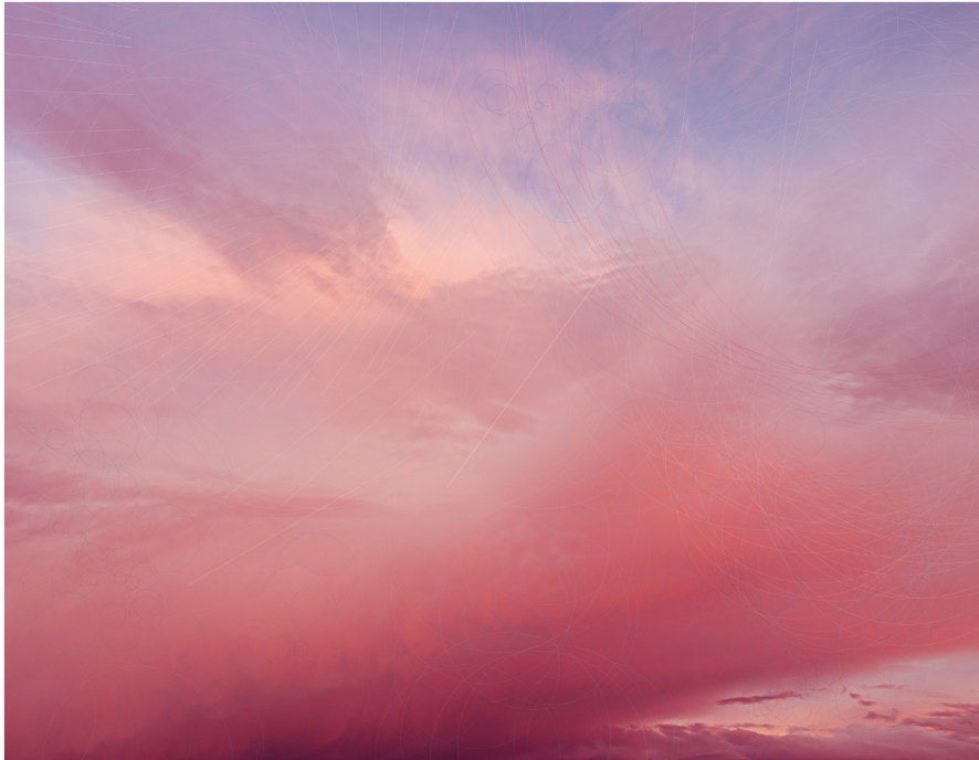
Trevor Paglen, CLOUD #557 / Hough Line Transform; Hough Circle Transform, 2023