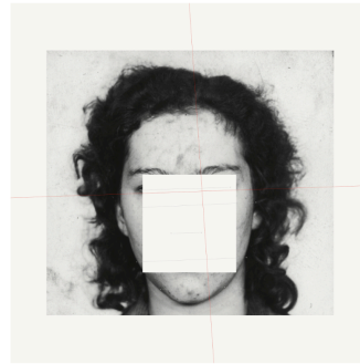
Trevor Paglen, They Took the Faces from the Accused and the Dead... (#00638_1_F), 2019

Miller: Your work is dedicated, in large part, to exposing the infrastructures of analytical and predictive systems that we can't see. Do you think that the recent shift in popular attention to generative AI—this widely available power to order up an image, or generate text—is a distraction from the underlying technologies? Or does it inspire you to pursue a new set of questions?