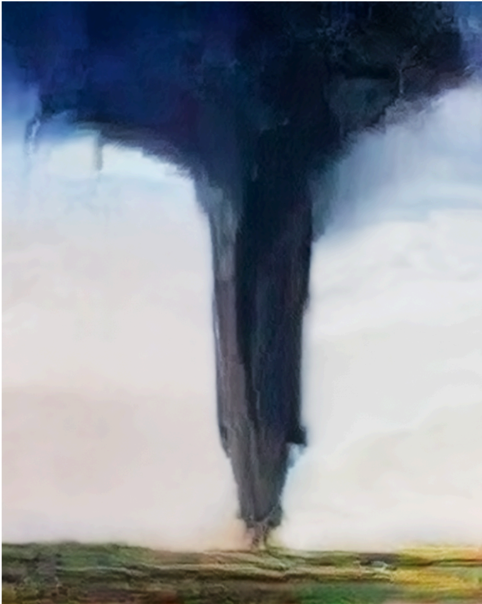
Trevor Paglen, Tornado (Corpus: Spheres of Hell) Adversarially Evolved Hallucination , 2017