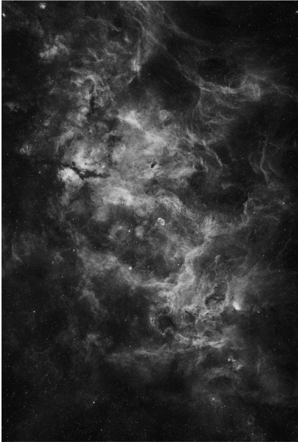
Trevor Paglen, UNKNOWN #89161 (Unclassified object near The Revenant of the Swan ) , 2023