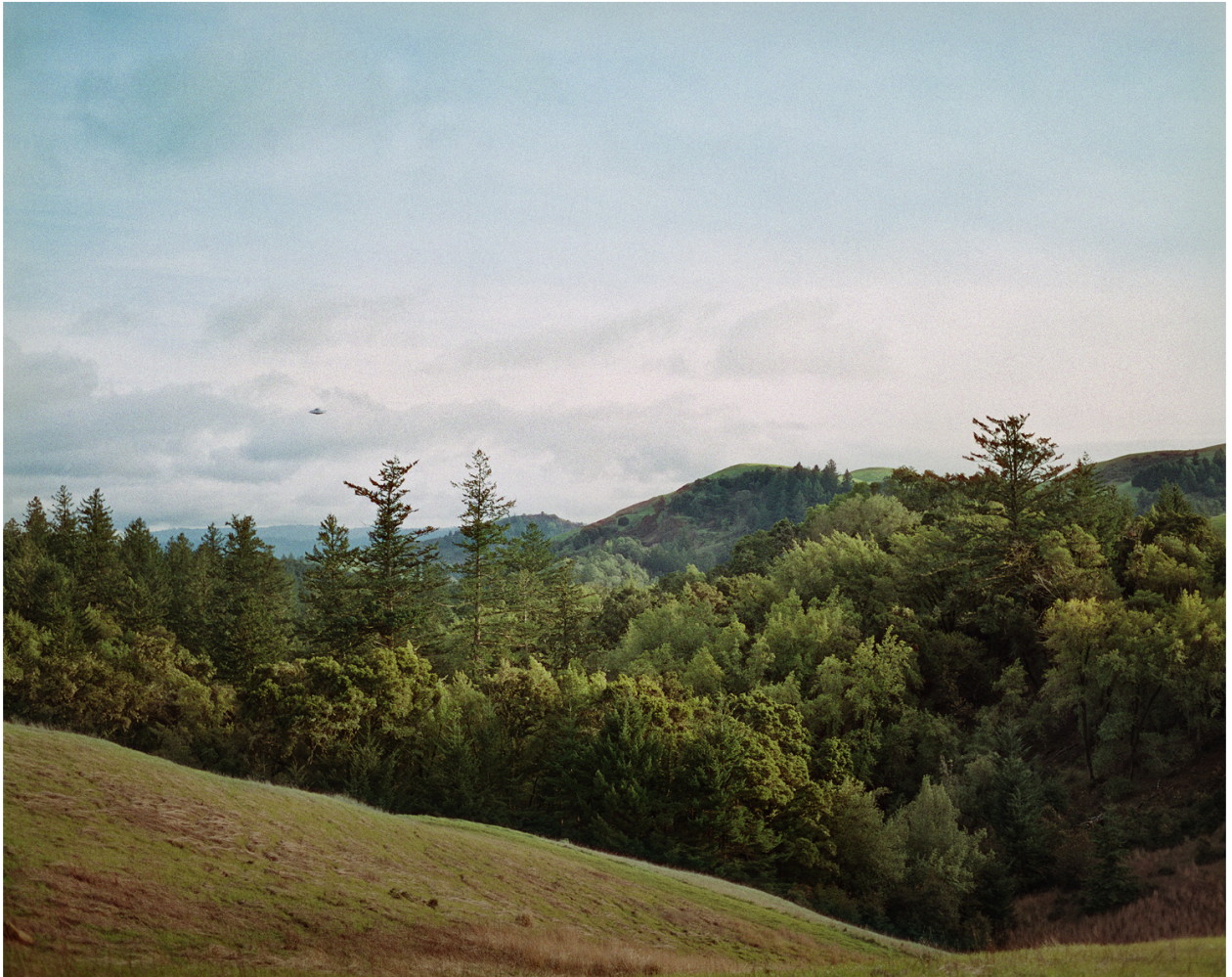
Trevor Paglen, Near Windy Hill (undated), 2024

I have a new project of UFO photography, which is something I've always been super interested in. I often think about UFO photography as the paradigm of photography. Something like, all photos are UFO photos. It's very much in line with the recent work on psyops.