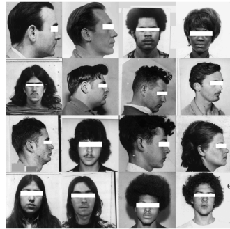
Trevor Paglen, They Took the Faces from the Accused and the Dead... (SD18), 2020. Mug shots of accused criminals and incarcerated people served as a common source for facial recognition algorithms in the early 1990s.